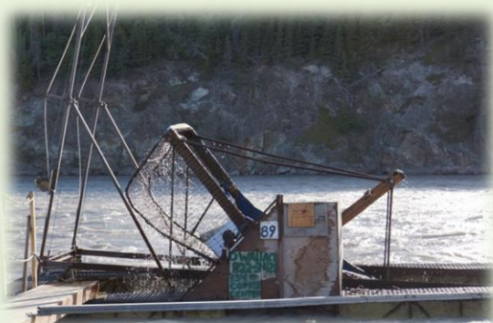
Fishwheel is used by the Alaskan to catch salmons from a river stream.