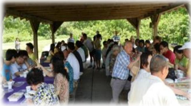
涼風徐徐，吹走連日的酷暑，正是野餐敘舊的好日子。