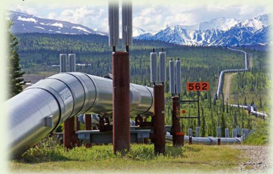
The trans-Alaska oil pipeline, as it zig-zags across the landscape from Prudhoe Bay to Valdez.