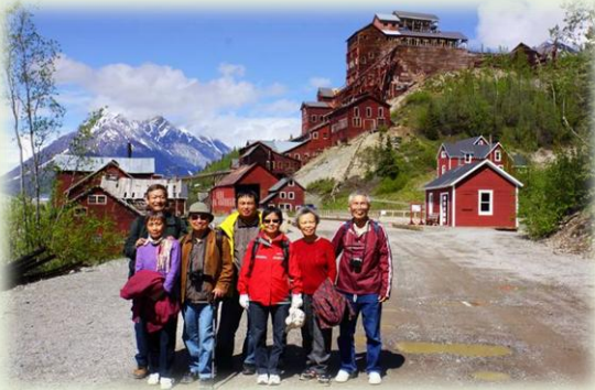
Group photo taken at the Kennecott Copper Mill - an abandoned factory.