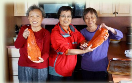
Ladies showing off the free Alaskan red salmon steaks caught by a fishwheel.