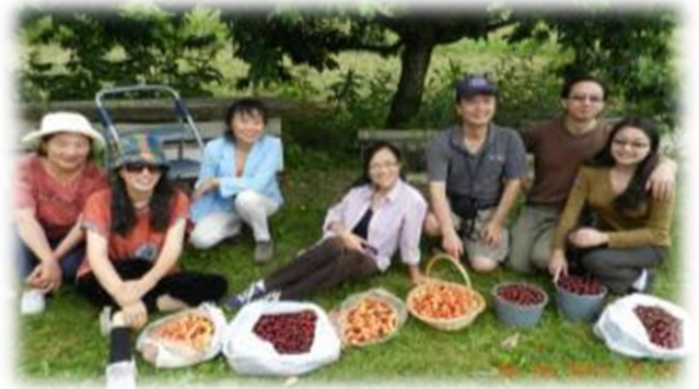
一籃籃、一袋袋的紫紅與橙黃，令人垂涎欲滴。